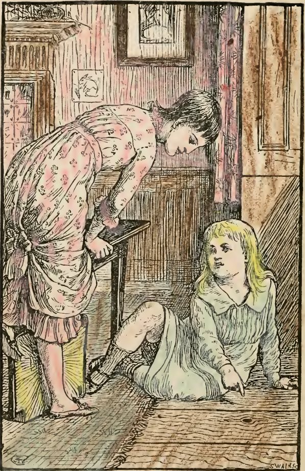
“WHAT IS THERE DOWN THERE, DOES YOU FINK?” SAID FIXIE.—Page 161.